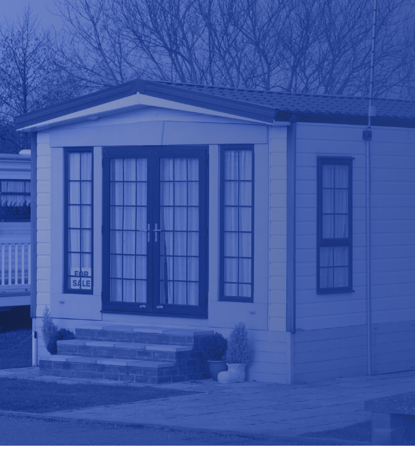
Managing Employee Housing